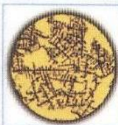
IMAGE B: Conception possible only during the pre-ovulating days but, reduced to 20-30%

FERTILE Fern-like structures covering a portion of, or the entire field