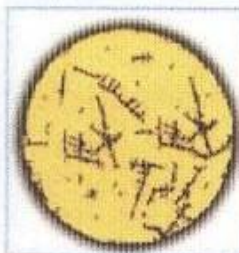
IMAGE A: No possibility to conceive

TRANSITION THREE DAYS PRE-AND POST FERTILE PERIOD Small fern-like patterns within dotted structures